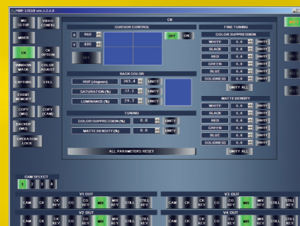
Chroma Key Display