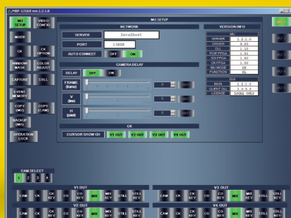
MBP-100CK Set-up Display